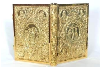
The Gospel According to Matthew 9:1-8

our serving; he who teaches, in his teaching; he who exhorts, in his exhortation; he who contributes, in liberality; he who gives aid, with zeal; he who does acts of mercy, with cheerfulness. Let love be genuine; hate what is evil, hold fast to what is good; love one another with brotherly affection; outdo one another in showing honor. Never flag in zeal, be aglow with the Spirit, serve the Lord. Rejoice in your hope, be patient in tribulation, be constant in prayer. Contribute to the needs of the saints, practice hospitality. Bless those who persecute you; bless and do not curse them.